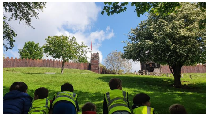
Year 2's about to invade the castle

Year 2 have had another great week capped off with a really enjoyable trip to Mountfitchet Castle. The children enjoyed mixing with the live animals, placing their heads in the stocks and finding out what working life in the castle was like. In Maths we have worked on 2-step problems involving money and recapped adding and subtracting 2-digit numbers using our knowledge on tens and ones. In English we started to write recounts of our trip. In Spelling we recapped some of the spelling rules we have worked on throughout the terms ('o' makes an 'u' sound, eg brother and, 'a' makes an 'or' sound before 'll', eg ball/wall). In Geography we looked at different physical features including mountains, valleys, cliffs and rivers and considered what advantages they might provide a castle with. In Art some of the children completed their 'castle and sun' paintings using a watercolour wash. Thanks for all your support over this half term. I hope you have a great break.